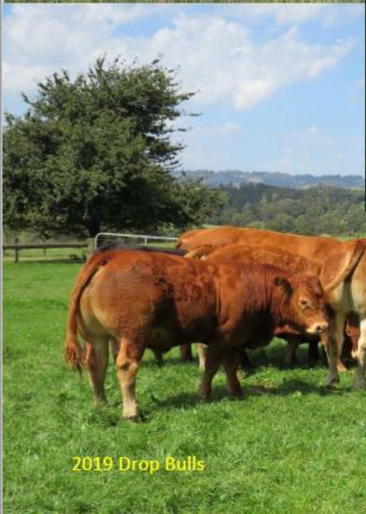
2019 Drop Bulls

Conveniently Located at 151 Hamiltons Road Warragul Sth. {2 minutes from Lardner Park}.