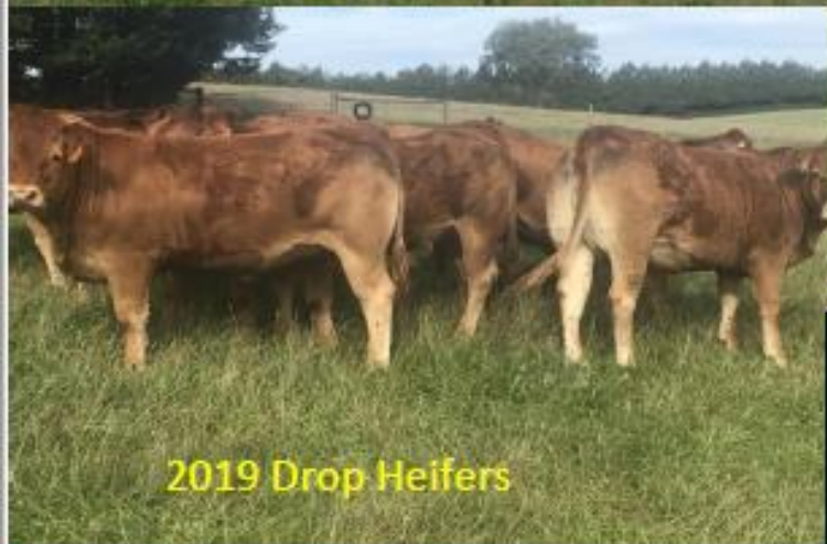
2019 Drop Heifers